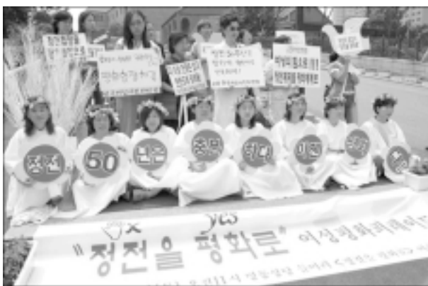
Members of the Women Making Peace are demonstrating wearing white garments symbolizing peace at Myongdong Cathedral, Seoul, 24 July, 2003. 29 July 2003 was the 50th Anniversary of the Armistice Treaty of the Korean War. The slogans read: 'Fifty Years (of Armistice) Is Enough!', 'Change Armistice into Peace!'

The post of Ministry of Gender Equality was established in January 2001. On the international stage, as Korea joined the United Nations in 1991, it came to participate in a variety of activities relating to women pursued by the UN. With Korea's endorsement of the UN Convention on the Elimination of All Forms of Discrimination Against Women (CEDAW), the environment was created to make and implement women's policies in line with international standards upholding the principle of equality between men and women. The formation and change of women's policy and the corresponding rise of women's status in Korea can be understood in this context of an active women's movement, the establishment and development of women's studies and the entry of Korea into the UN system. ☀