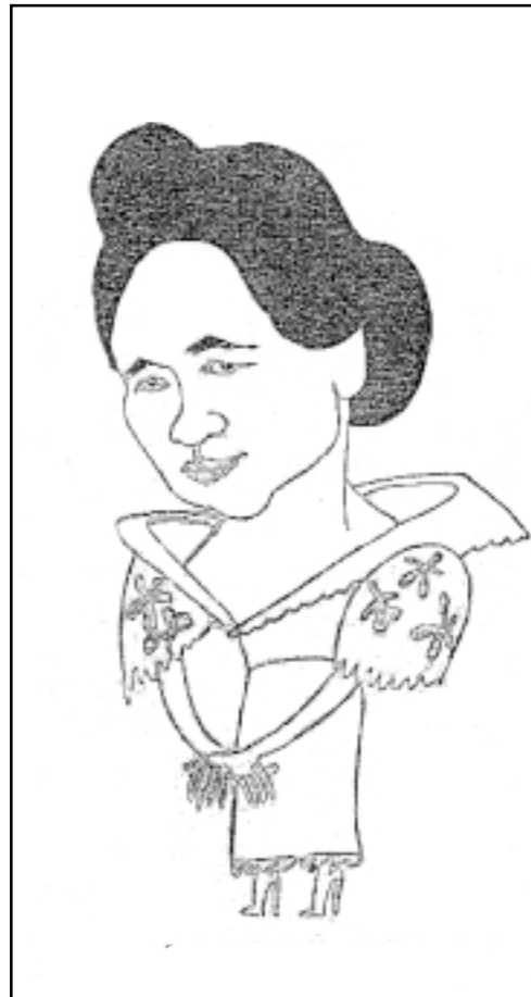
A cartoon of Encarnacion Alzona.

Alzona, Encarnacion (1954). The Filipino Woman: Her Social, Economic and Political Status, 1565–1937 . Manila: Benipayo Press.